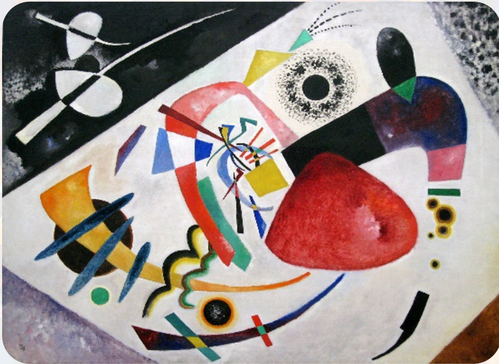
Red Spot II (1921) by Wassily Kandinsky