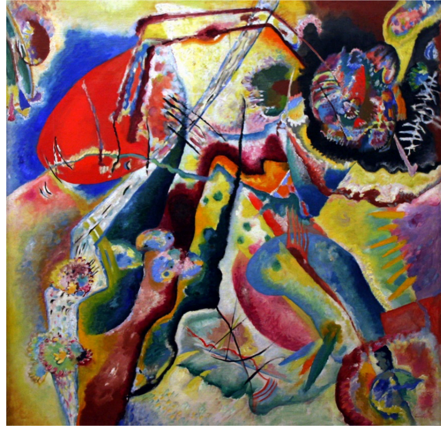
Abstract Painting by Wassily Kandinsky

Wassily Kandinsky was a Russian painter. Many people think he was the first abstract artist.