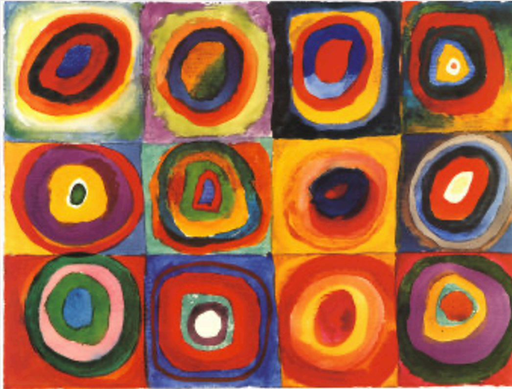
Colour Studies: Squares with Concentric Circles by Wassily Kandinsky