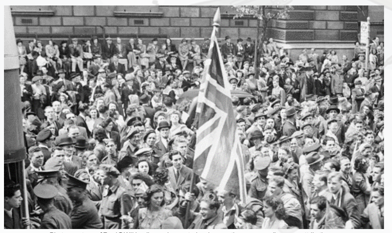
Photo courtesy of Fæ (@Wikipedia.com) - granted under creative commons licence - attribution