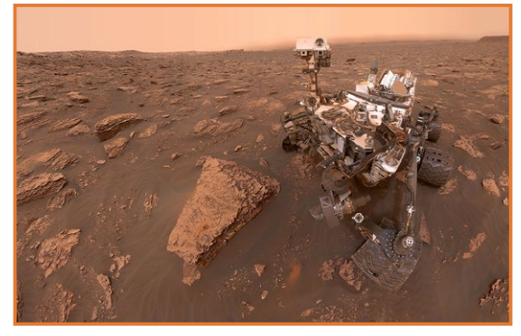
A self-portrait taken by NASA's Curiosity rover.

radiation – Energy emitted by the Sun, some of which is dangerous to humans when not absorbed by the atmosphere of a planet.