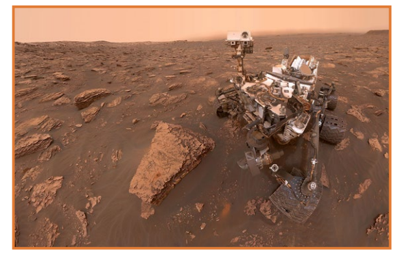
A self-portrait taken by NASA's Curiosity rover.

radiation – Energy emitted by the Sun, some of which is dangerous to humans when not absorbed by the atmosphere of a planet.