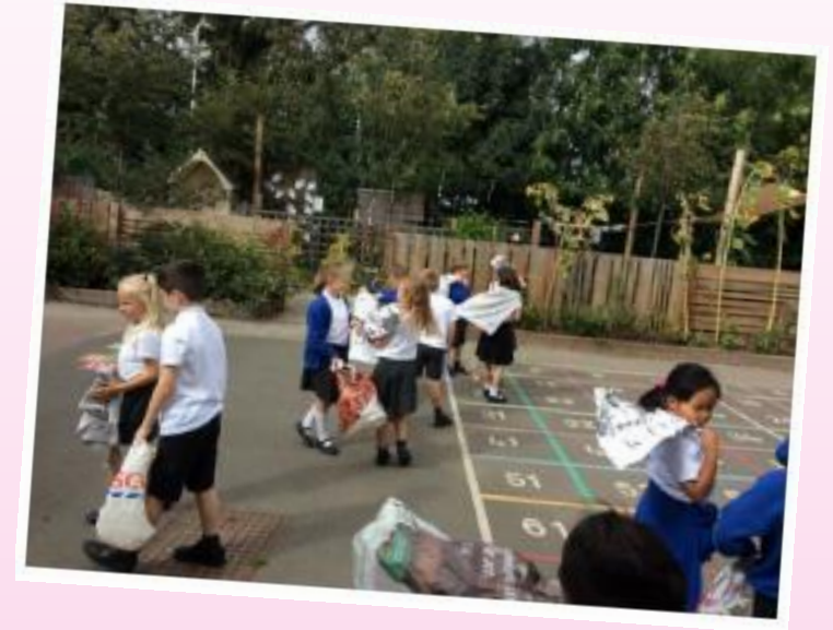
Science experiments like choosing the right material for superhero capes