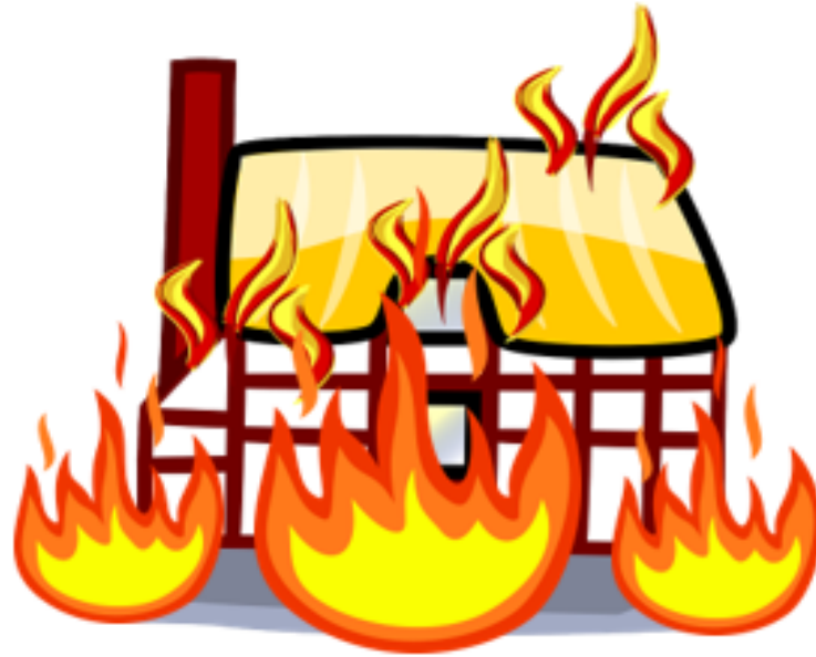
The Great Fire of London