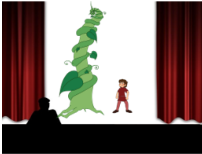
Jack and the Beanstalk