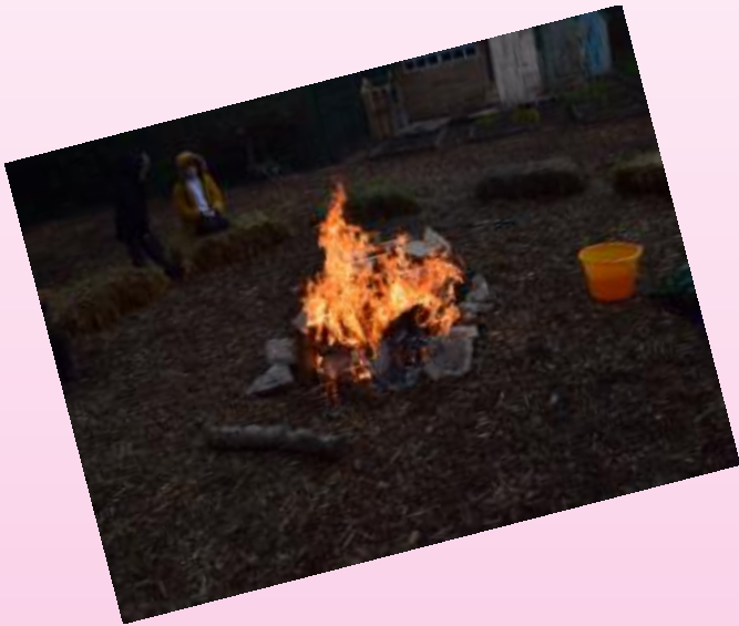
Learning about the Great Fire of London